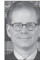
HON. STEVEN W. RHODES United States Bankruptcy Court—Eastern District of Michigan Detroit