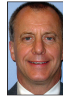
HON. JEFFREY R. HUGHES United States Bankruptcy Court—Western District of Michigan Grand Rapids