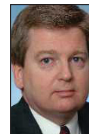
HON. THOMAS J. TUCKER United States Bankruptcy Court—Eastern District of Michigan Detroit