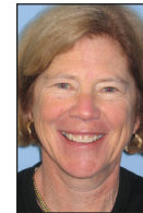
HON. MARCI B. McIVOR United States Bankruptcy Court—Eastern District of Michigan Detroit