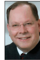
HON. DANIEL S. OPPERMAN United States Bankruptcy Court—Eastern District of Michigan Bay City