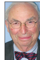
HON. WALTER SHAPERO United States Bankruptcy Court—Eastern District of Michigan Detroit